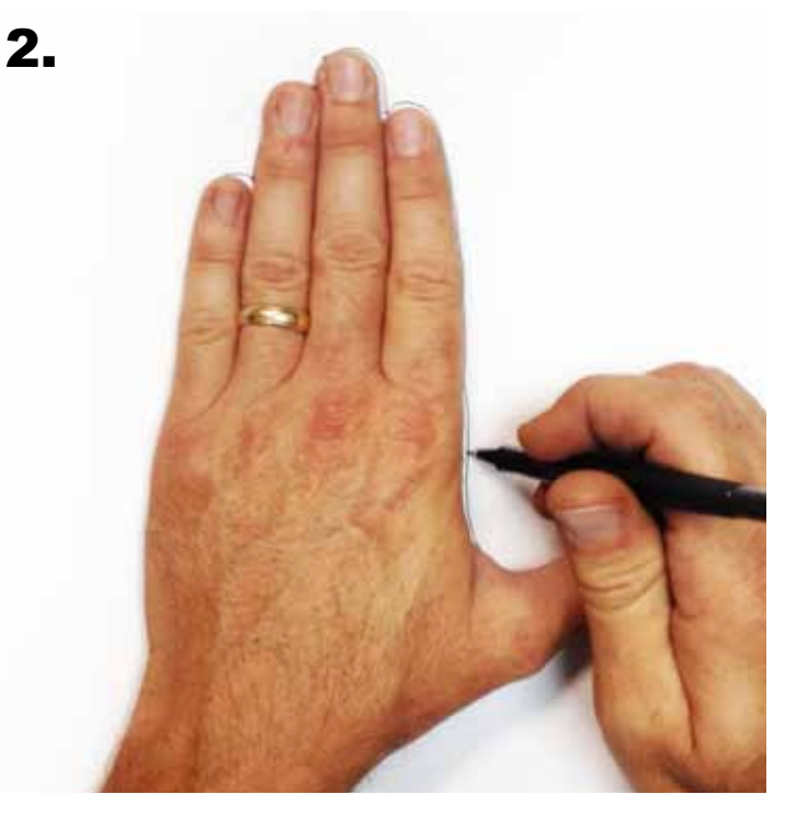
When finished tracing - mark the spot on either side of your knuckle area where the knuckle area is at its widest point.